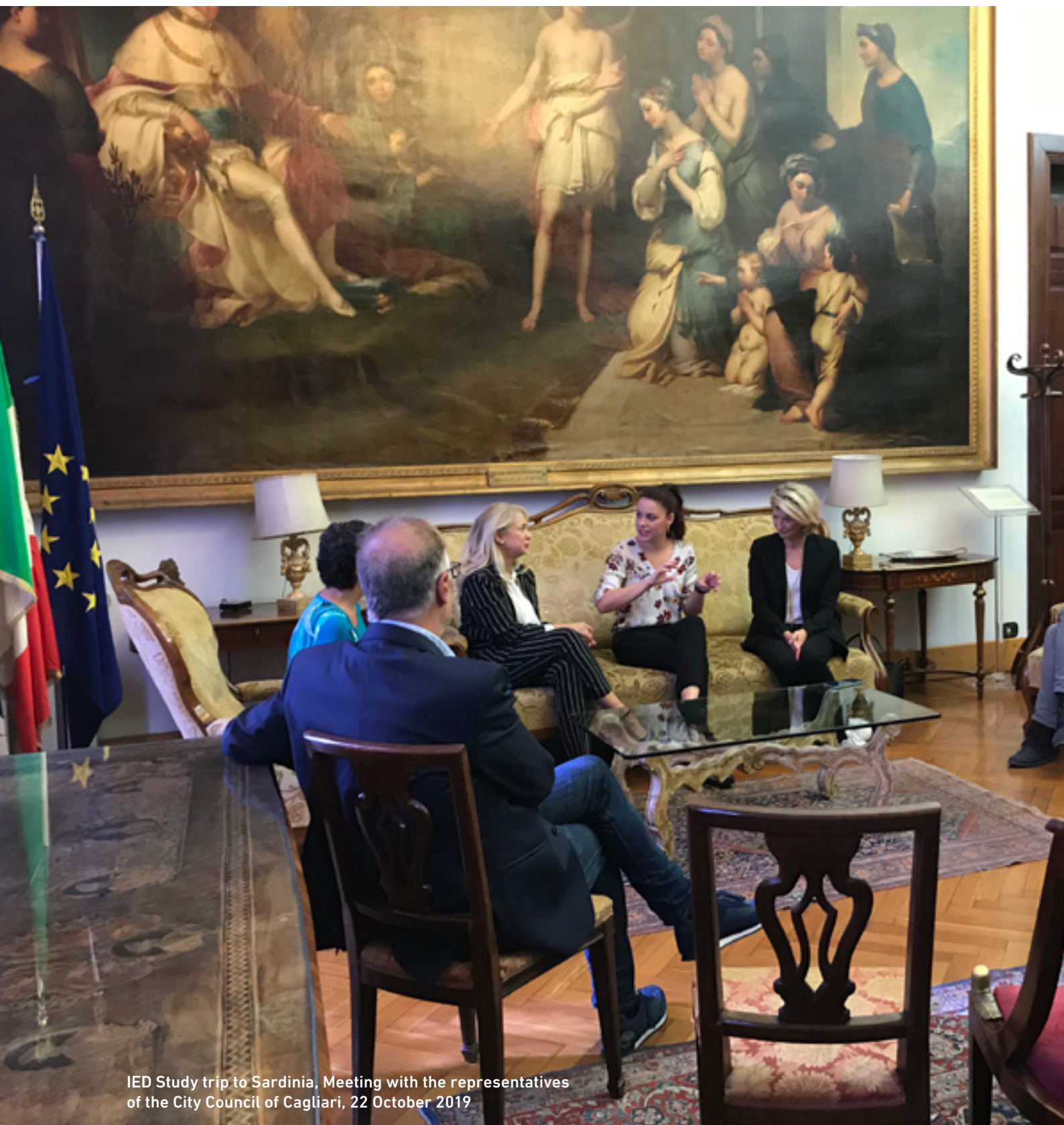
IED Study trip to Sardinia, Meeting with the representatives of the City Council of Cagliari, 22 October 2019