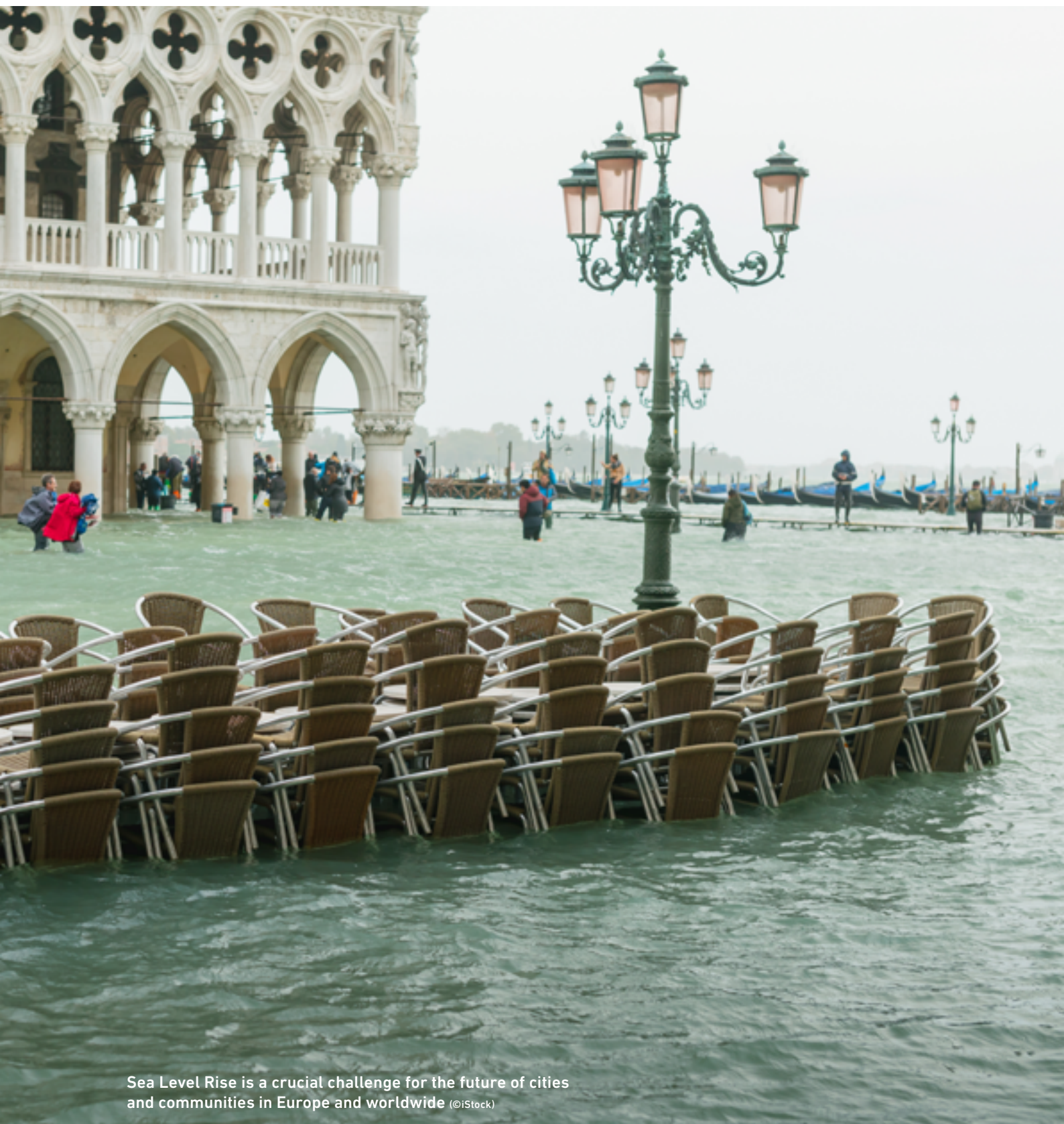
Sea Level Rise is a crucial challenge for the future of cities and communities in Europe and worldwide