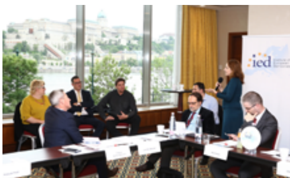
IED SEMINAR AND CONFERENCE, BUDAPEST, 29 APRIL 2019