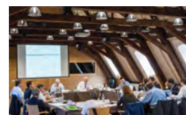
PUBLICATION: FROM THE EUROZONE TO A "EURO UNION"