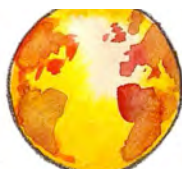
COP 21: AN ANNOUNCED FAILURE...OR A LAST MINUTE AGREEMENT? PARIS