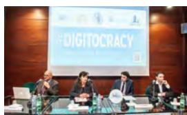
FOLLOW-UP: #DIGITOCRACY IED SMART CITY WORKSHOP